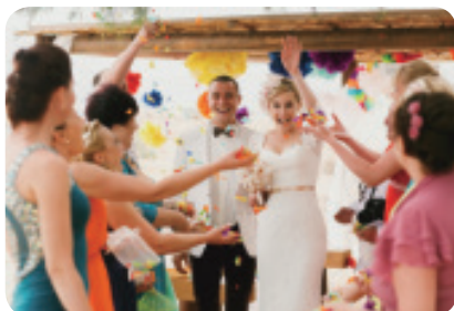
House of Worship & Event