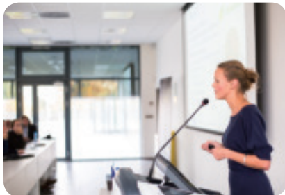
Education & Training